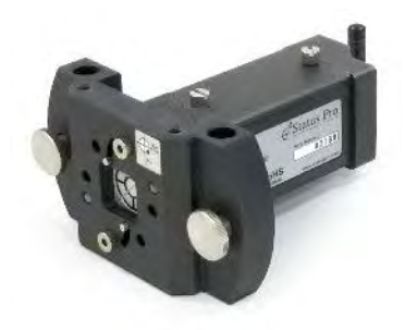
R545 Laser Receiver with a 2-Axis-PSD Technology and Bluetooth Interface (SP R545-P)

The R545 is a very accurate and yet robust Laser Position Sensor especially developed for measuring linearity.